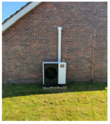
Air Source Heat Pump